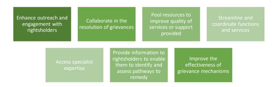
Figure 1 – Value of Partnerships in Implementing Grievance Mechanisms

For VSS organizations, working with third party partners could be essential to extending the capacity of VSS-level grievance mechanisms. VSS organizations may not have sufficient in-house capacity to support all the functions required in operating an effective grievance mechanism. In these instances, working with third party partners could bring additional resources to the table to enhance the effectiveness of the grievance mechanism. Most mechanisms have limited budget and capacity for outreach to rightsholders and affected stakeholders and may rely upon CSOs to act as intermediaries.